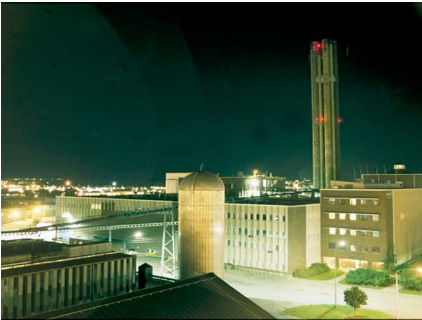
MultiSimplex fits all solid fuel plants